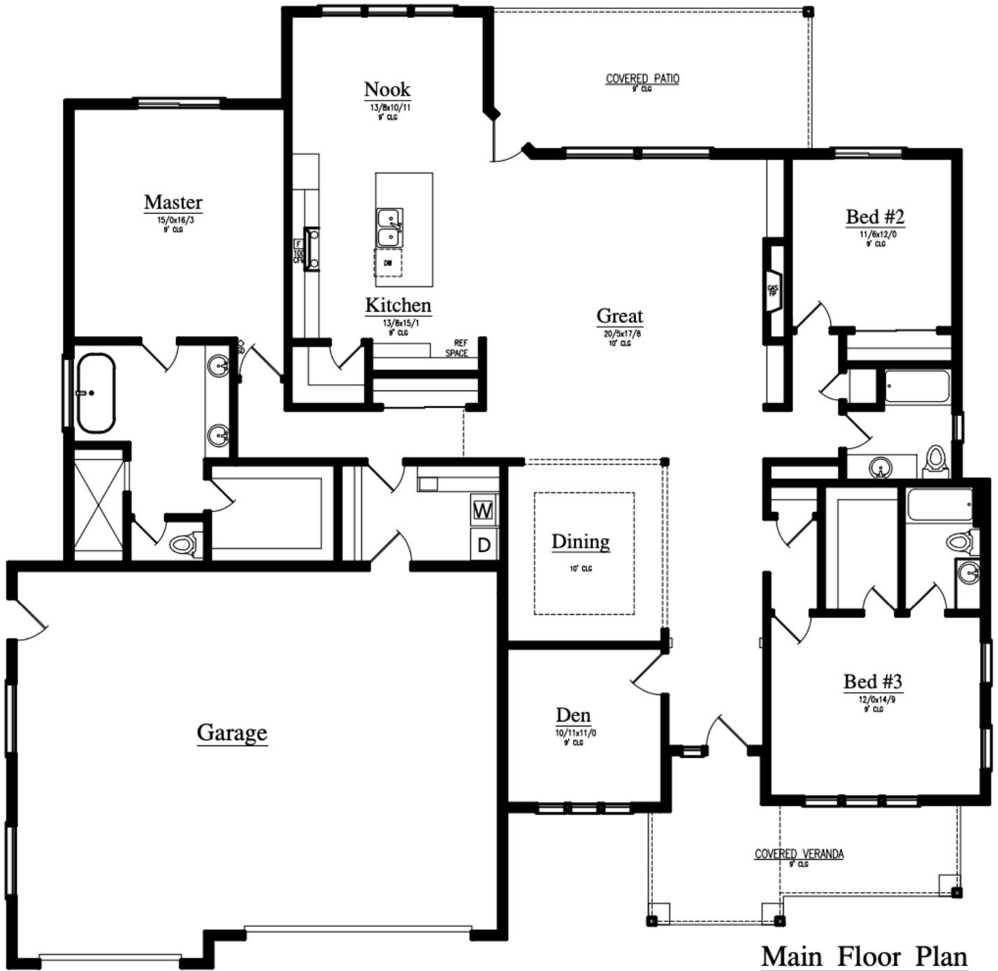
Main Floor Plan

SIGNATURE HOMES LLC RESERVES THE RIGHT TO MODIFY FLOOR PLANS, DESIGNS AND PRICES. DIMENSIONS AND SQUARE FOOTAGE ARE APPROXIMATE